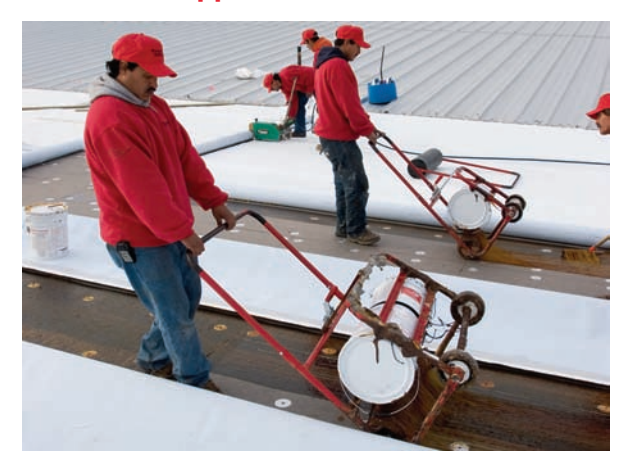
UltraPlyTPO XR can be fully adhered, using environmentally friendly XR Bonding Adhesive, applied with hot asphalt or mechanically attached.