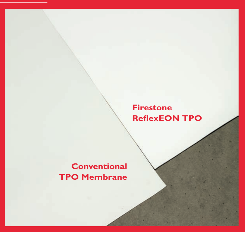
ReflexEON TPO is significantly whiter and brighter than standard TPO membrane.

The chief advantage of a light colored roof is its ability to reflect UV radiation which may improve a building's energy efficiency. Firestone's new ReflexEON TPO extends those advantages, as it is the brightest, most reflective TPO membrane on the market today. Additionally, the increased brightness will help to maintain its reflectivity level.